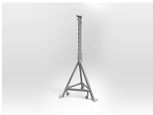
HS08LR support stand, 8.2 t, 1260-1990 mm