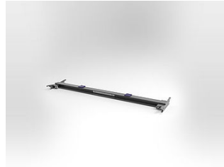
EHB1005TR10 Truck crossbeam, 10 t, length 3000 mm