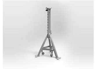
MS08LR support stand, 8.2 t, 790-1270 mm