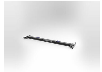
EHB905TR113500 Crossbeam, 11 t, length 3500 mm