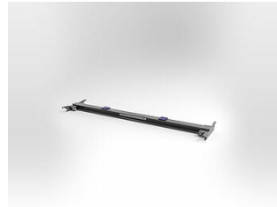
EHB905TR113000 Crossbeam, 11 t, length 3000 mm