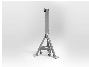
MS08LR support stand, 8.2 t, 790-1270 mm