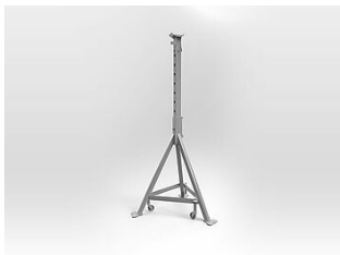
HS08LR support stand, 8.2 t, 1260-1990 mm