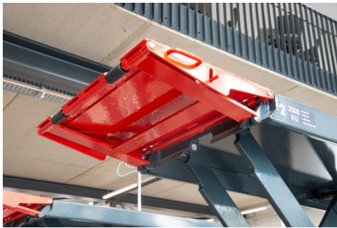
Stable drive-on ramps made of tear plate