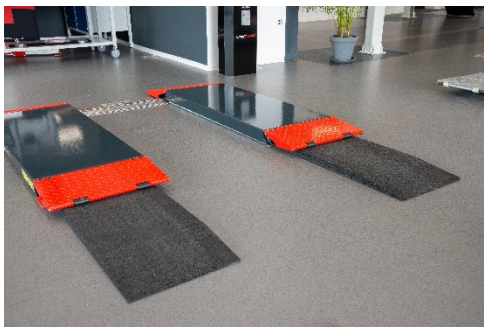
Drive-on extension for very flat vehicles