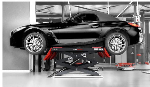
Flat sports car