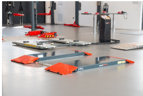
Especially flat design < 100 mm