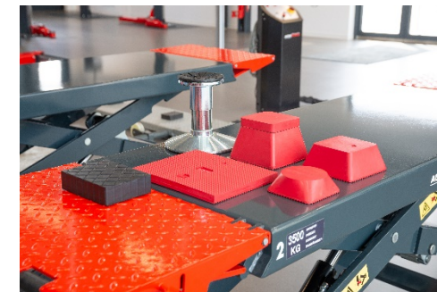
Rubber pads as accessories