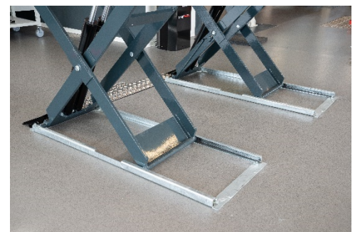
Hot-dip galvanised base frame as standard