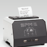
SPM : Smart Printer Module 026919