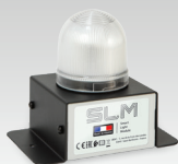
SLM : Smart Light Module 027978